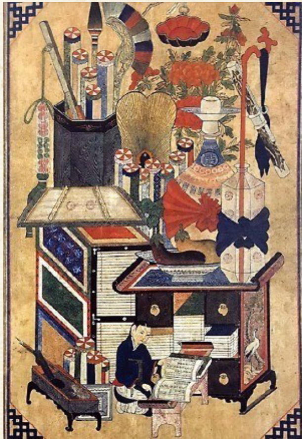
Book Street Painting 19th century. Colors on paper. Four-paneled screen. Each 55 cm x 35 cm. Private collection