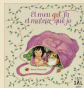
El meu gat fa el mateix que jo Lata de Sal gatos, Spain, 2013 (Spanish)