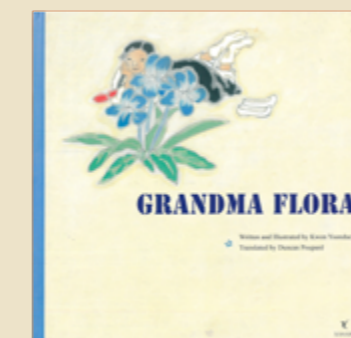
Grandma Flora XANADU Publishing, UK, 2017