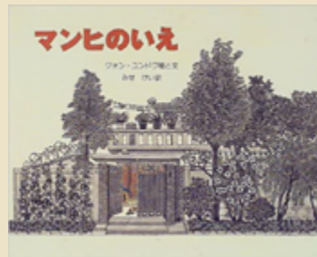
マンヒのいえ The Sailor Publishing Co., Japan, 1998