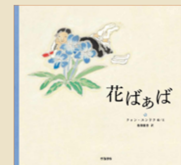
花ばあば コロから株式会社, Japan, 2018