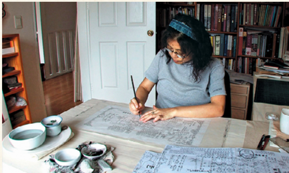
from the documentary film "The Big Picture"(2013)

Those are lyrics from the “Tail Song” from Jeju Island; the song lyrics are full of wordplay, so I wanted the pictures to reflect the abstractness of the poetry. And the lyrics gave me many colors to work with: the black crow, the with rabbit, the blue sky, and so on. I was most concerned with how to express those things abstractly, while ensuring that the colored spaces would convey a sense of rhythm that complemented the lyrics.