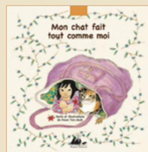
Mon chat fait tout comme moi Philippe Picquier, France, 2007