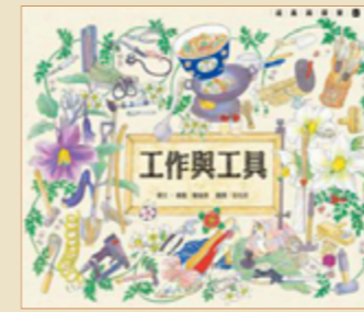
工作與工具 Wisest Cultural Enterprise, Taiwan, 2012