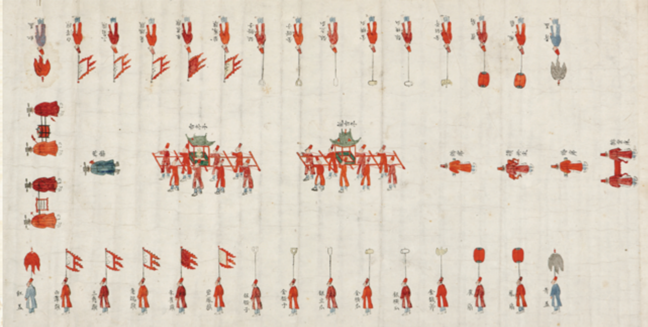
Royal Ritual Procession of King Seonjo Colors on paper. 499.9cm x 36.1cm.