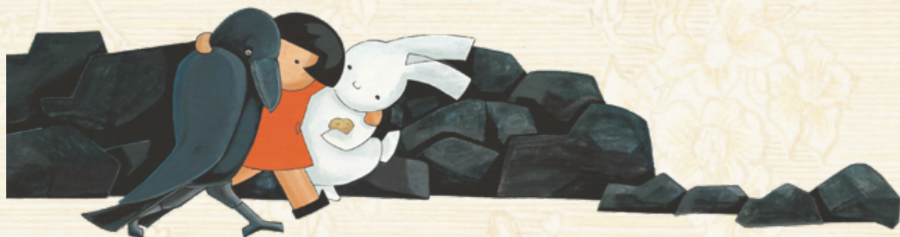
There Dangles a Spider

In My Cat Copies Me , the main character is a girl who is always home by herself for some reason. By playing and interacting with her cat, she discovers her inner strength and courage to go out into the world. The cat is a loving pet, but when the cat gets angry, it curls up its body and protects itself. The shy little girl learns from the cat and finds courage to fight against her own fears. In the colorful and eye-catching illustrations, the girl and the cat take care of each other and grow up together.