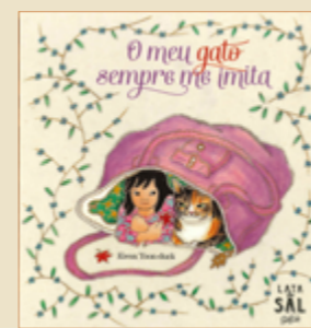
O Meu Gato Sempre Me Imita Lata de Sal gatos, Spain, 2013 (Catalan and Galician)

*(forthcoming), Akane Shobo Publishing Co., Ltd., Japan