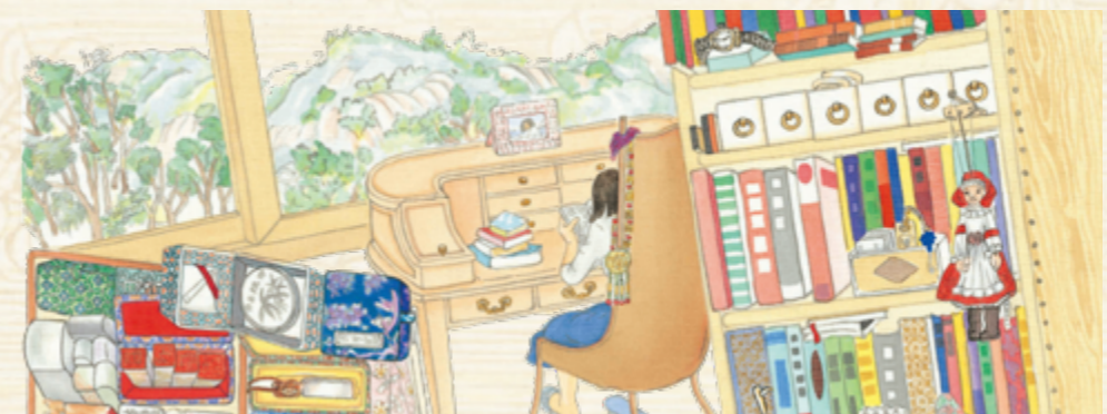
Tools at Work

Website : https://mopilo.wixsite.com/kwonyoonduck email : mopilo@hanmail.net