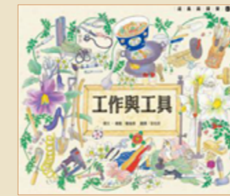
工作與工具 二十一世紀出版社, China, 2014