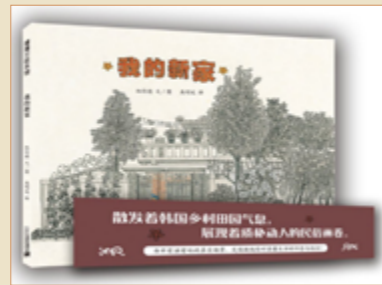
我的新家 二十一世紀出版社, China, 2014