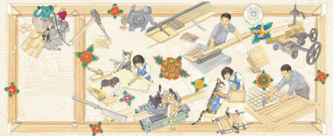
In Tools at Work , the illustrations show tools floating in the air not as the writer sees them but as workers see them or as the tools see the world.

main characters but also the other characters contribute to the narratives in their own unique ways, which is especially evident in her illustrations for Manhee's House and Tools at Work . In Flower Granny , Pikaia , Wooden Seal , Sixteen , and Brave Mr. Tiger , she also uses the multi-point perspective to reveal the conflict between the characters and the changes that take place in them. For example, she has humans change places with animals and plants in Pikaia , and she expresses how perpetrators are also victims at the same time in Sixteen and Brave Mr. Tiger .