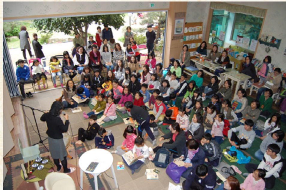
Lecture after the publication of Wooden Seal , Books and Children's Bookshop in Busan.