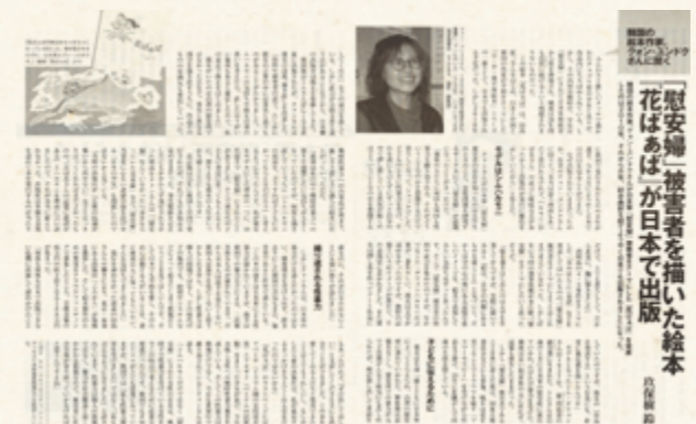
Original article in weekly magazine Every Friday