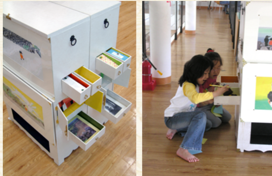
Young readers open the drawer and find pictures, information, and different materials related to the book There Dangles a Spider .

Her communication with young readers does not stop only at publishing picture books. She meets young readers by holding interactive exhibitions, organizing educational programs, and staging theatrical adaptations of her books.