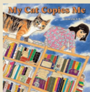
My Cat Copies Me Kane/Miller Book Publishers, USA, 2007