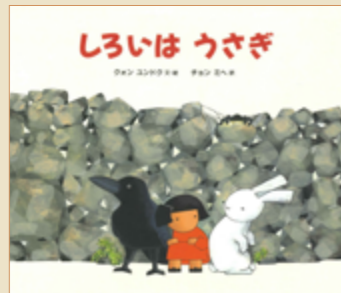
しろいはうさぎ Fukuinkan Shoten(福音館書店), Japan, 2007