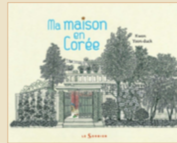
Ma maison en Corée Editions du Sorbier, France, 2008