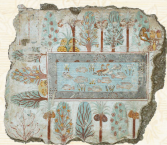
The Gardens of Nebamun, Egyptian mural

A painting such as this is drawn not from what the artist sees but from what the artist knows about the subject, as in the Egyptian mural The Gardens of Nebamun (below), which was drawn from the multi-point perspective.