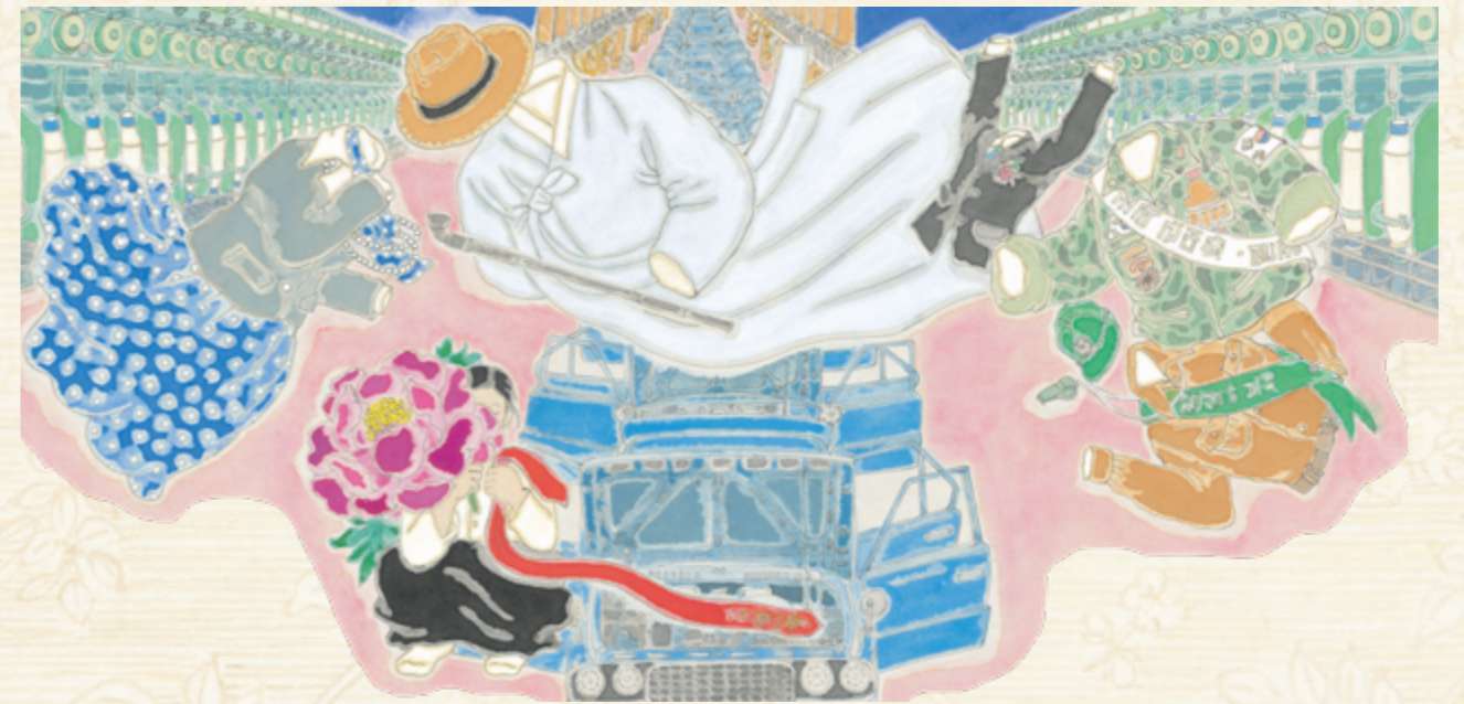
Kwon criticizes not only Japan's inhuman violence against comfort women but also Korea's patriarchic system which placed the blame on the women.