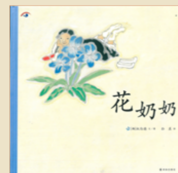
花奶奶 译林出版社, China, 2015