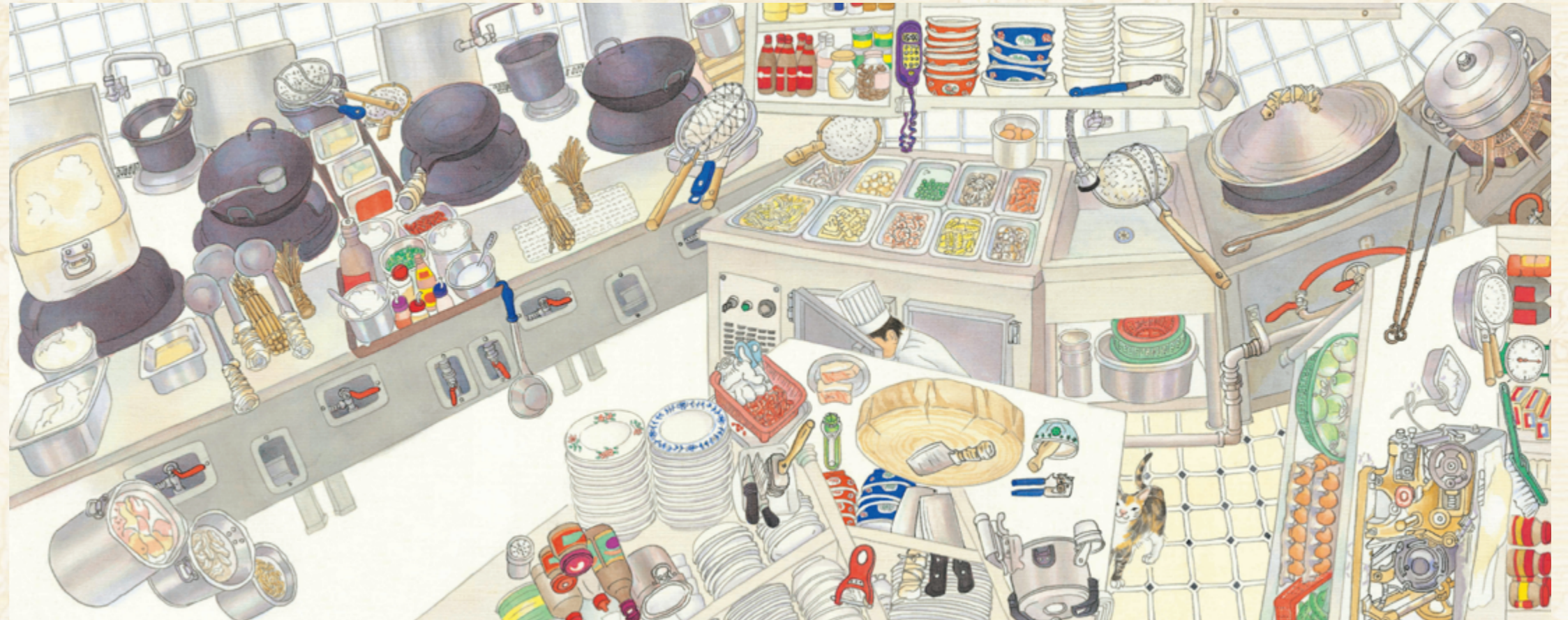
Tools at Work Various tools are painted out of proportion, and in the reverse perspective for viewers to see them clearly.