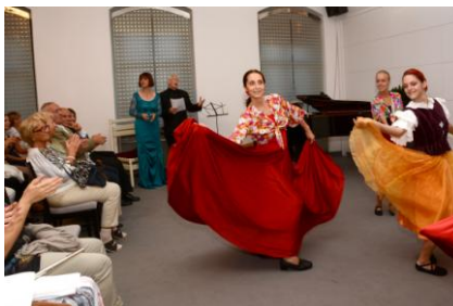
Dancing performance of group „Nezábudka“

BOOK FEAST In September 16, 2017 , BIBIANA, the International House of art for children and SK IBBY organised open-air festival Book feast, focused on the culture of reading. Part of the program was attractive form of reading, presentations of writers, illustrators, musicians, happening activities, theatrical performances of the stories of children's books, an unusual form of dramatic reading and reading riddles. In the program participated also the Bratislava District -Old Town, OZ Fanfary, the national culture centre, libraries, schools and initiatives dedicated to reading to children. The winners of the biggest nationwide competition in reciting Hviezdoslavov Kubín performed as well.