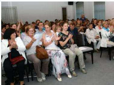
Music Hall at Zichy during the Concert