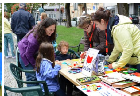
Presentations of Publishers