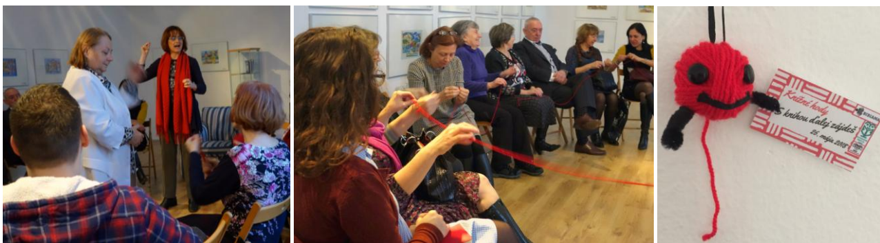
Preparations for the May reading festival BOOK FEAST 2018 Wrapping around a bunch of wool balls, created magical Gulko Bombulko.

NEW FEAST At the beginning of the year, some people celebrate, others party, we had a feast in the Centre for children's literature, reading and SK IBBY. At the first meeting of the partners of the 2018 BOOK FEAST, on January 30, 2018 , we wrapped around a bunch of wool balls, created magical Gulko Bombulko, our national fairy-tale hero, and got into the first preparations for the May reading festival. With the faithful pig brothers Budkáčik and Dubkáčik, we put the slogan of the 2018 BOOK FEAST - Books can bring you further! Visitors will be able to see on Saturday, May 26, during the open air reading festival.