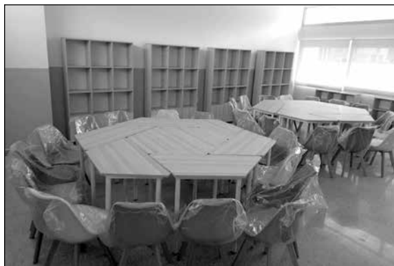
Achrafieh Third Public School after renovations