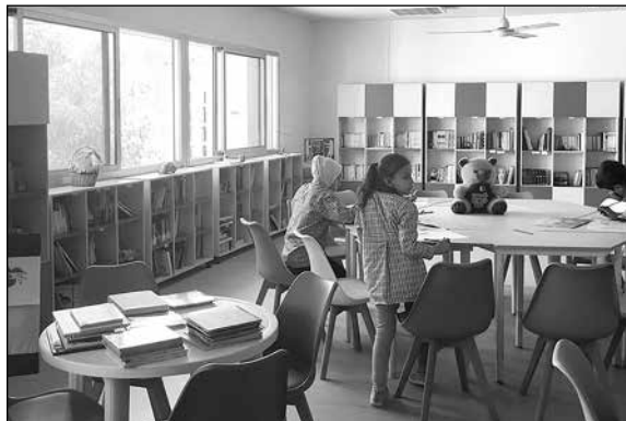
Al Alia school after renovation

A SWOT analysis was conducted to evaluate the strengths, weaknesses, opportunities, and threats of this project to aid in future ventures and to help improve this project. Another analysis was conducted to assess