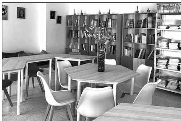
Al Shahid Aadan Hiibaw after renovation

The evaluation reflected on both the first phase of the project for trainees and the second phase, as they were asked to write an evaluation letter at the end of the training program.