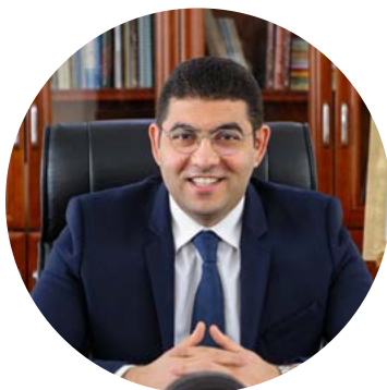
Mohamed Mehdi Bensaid

Graduate in political science and international relations from the Institute of Political Studies of Toulouse, in law from the Faculty of Toulouse, holder of a master's degree in African affairs from the Institute of Political Studies of Paris as well as in international relations from the Institute of International and Strategic Relations of Paris. Former President of the Cercle des jeunes démocrates marocains, elected to the House of Representatives of the Kingdom of Morocco, Chairman of the Parliamentary Foreign Affairs Committee in 2014, Member of Parliament. Since 2021, Minister of Youth, Culture and Communication.